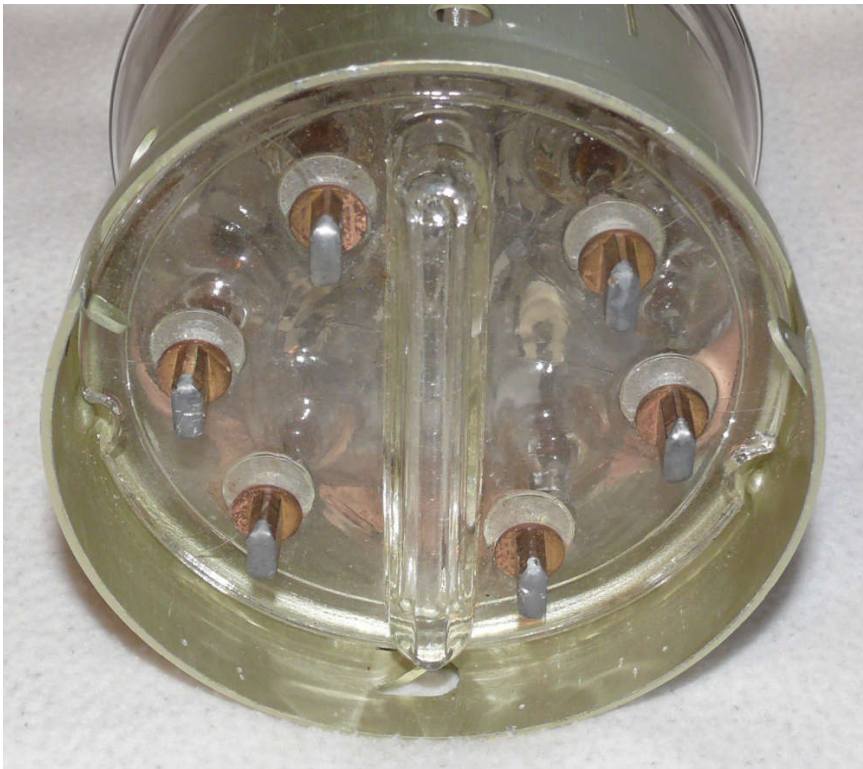
Base of the gu-81 bottom view