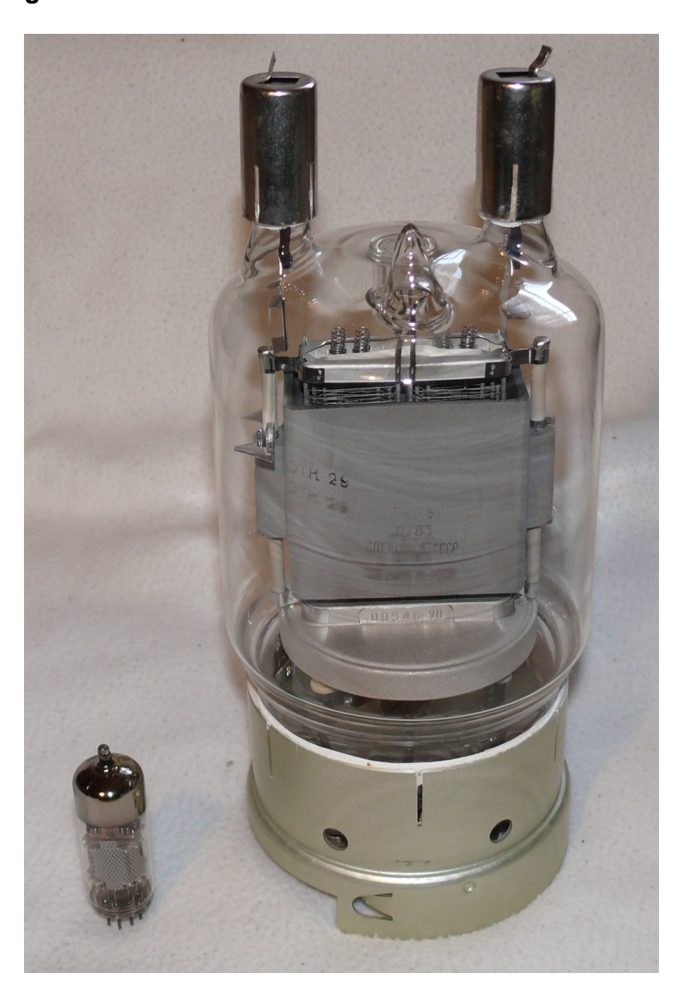
The gu-81 is a Russian transmitter tube. Above a size comparison to an EF80.