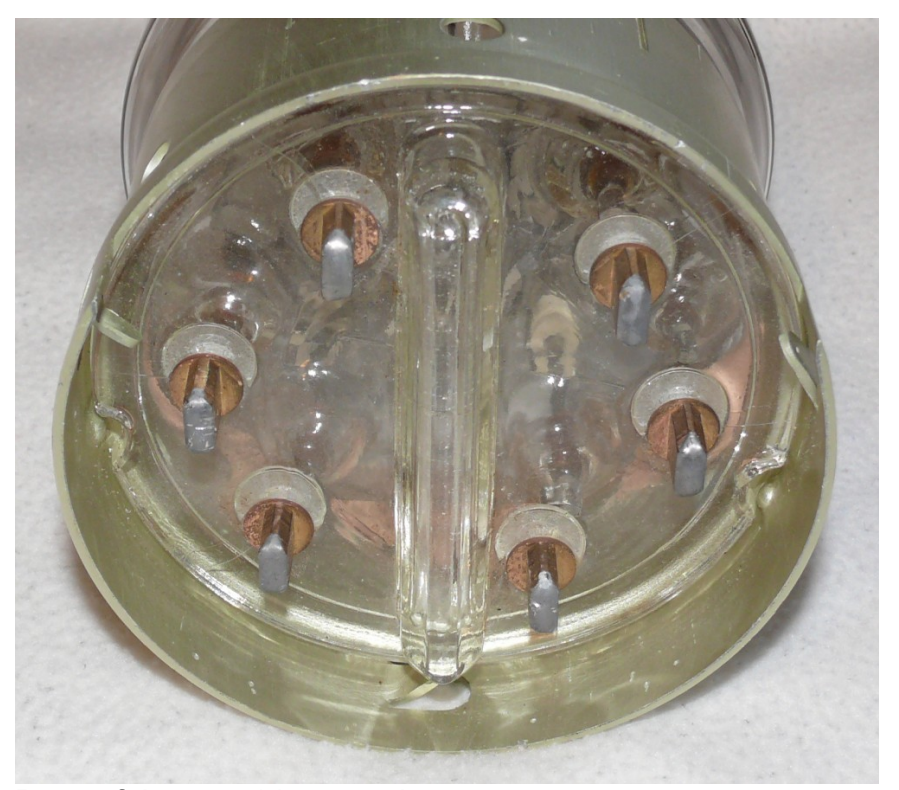
Base of the gu-81 bottom view